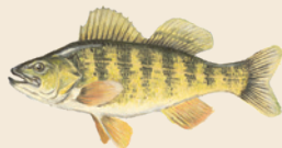
#1 Yellow Perch

The three most preferred species when ice fishing: