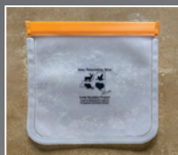
Reusable sandwich bag