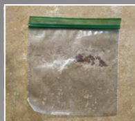
Plastic sandwich bag