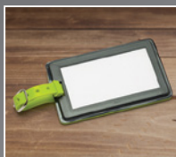
Reusable plastic tag holder