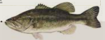
Illustration by Duane Raver, USFWS